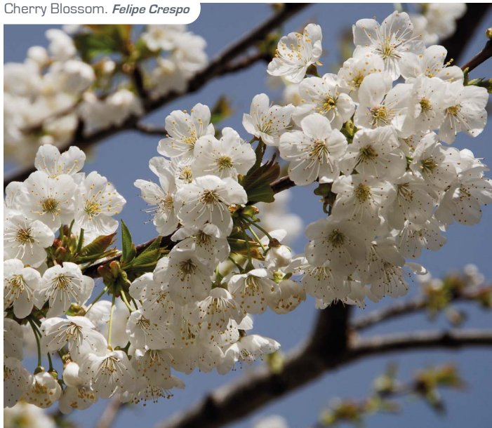
Cherry Blossom. Felipe Crespo