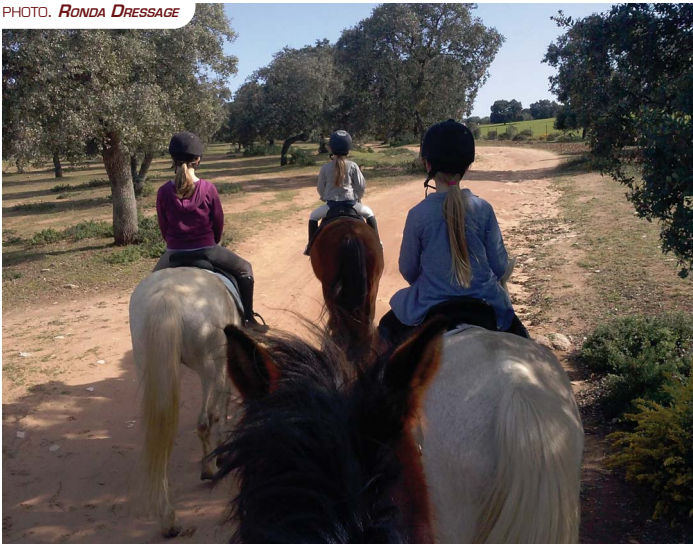
PHOTO. RONDA DRESSAGE